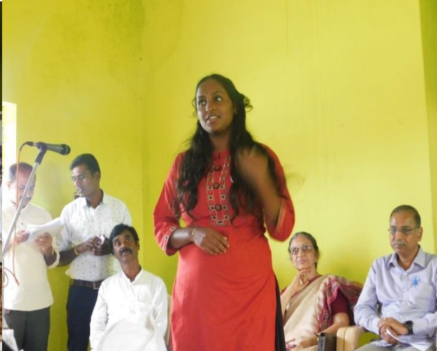
The NSS Volunteers have expressed their opinion and experience about the Programme of NSS Annual Special Camp-2023 at Yashodharapura.