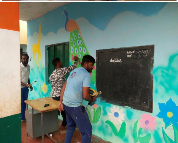
At 5a.m.- Cleaning School premises, Cement plastering School Compound, Painting and depicting the Pictures on the walls of the Govt. Primary School building by Samarpana-Voluntary Service Team and by all NSS Volunteers from morning 5 a.m.