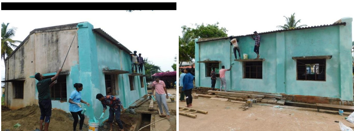
At 5a.m.- Painting the VSSS building by Samarpana-Voluntary Service Team and by all NSS Volunteers from morning 5 a.m.