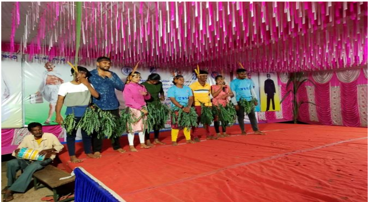
At 8.30p.m- Cultural activities by NSS Volunteers.