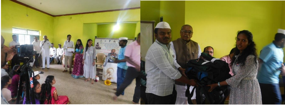
All Guests of the programme were honored all NSS volunteers with Bags, Books, Mementos and with Certificates.