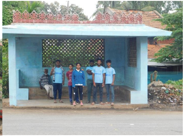
At 8a.m.- Cleaning and Painting Bus Stand by Samarpana-Voluntary Service Team and by all NSS Volunteers.