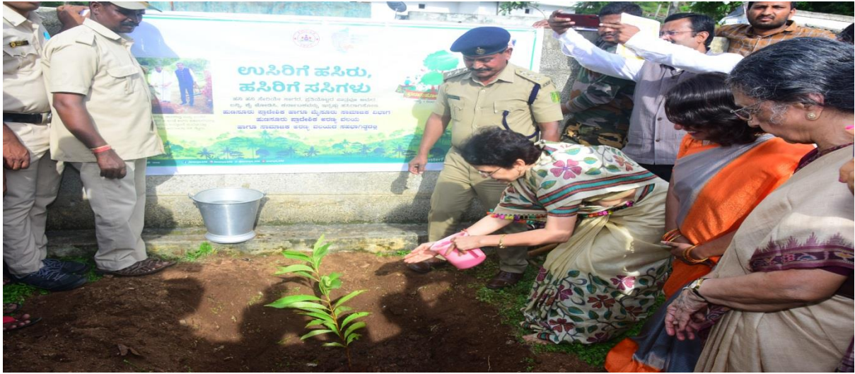
At 5 p.m. - Hon'ble Justice, K. S. Mudagal, Justice, High Court of Karnataka, Bengaluru has inaugurated the Vanamahotsava-2023 programme by sapling of plants on this occasion.