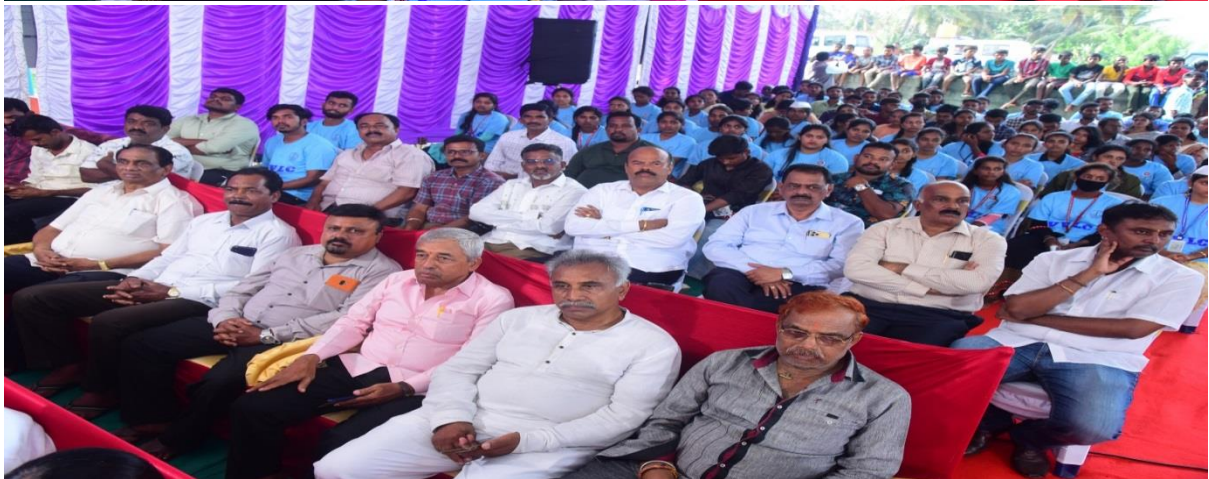
At 4 p. m. - all NSS Volunteers, villagers, guests and invitees were gathered at stage.