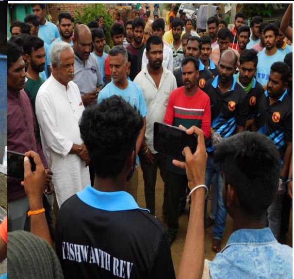
At 9.30a.m.- Leaders of village and Youth Group were cordially welcomed all NSS Volunteers and officers for breakfast to their homes with playing the instruments of Dollu, Nagari, Tamate etc..