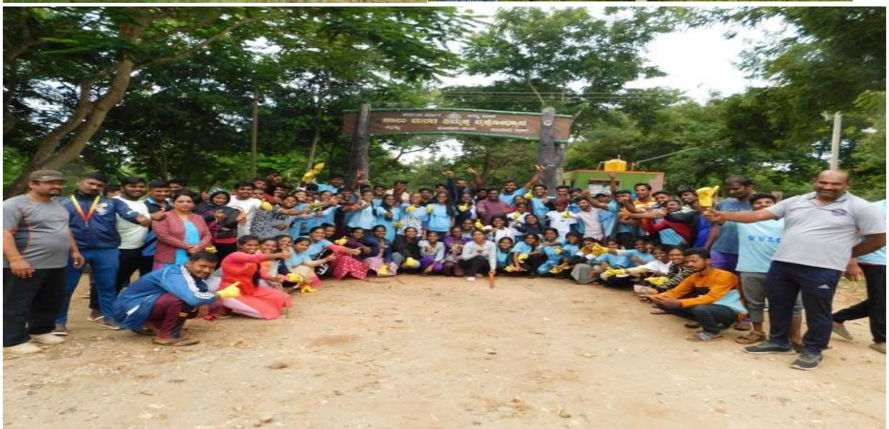
At 10.15a.m. - All NSS Volunteers involved in Cleaning work at Saalu Marada Timmakka Vrukshodyana, at Kallubetta.