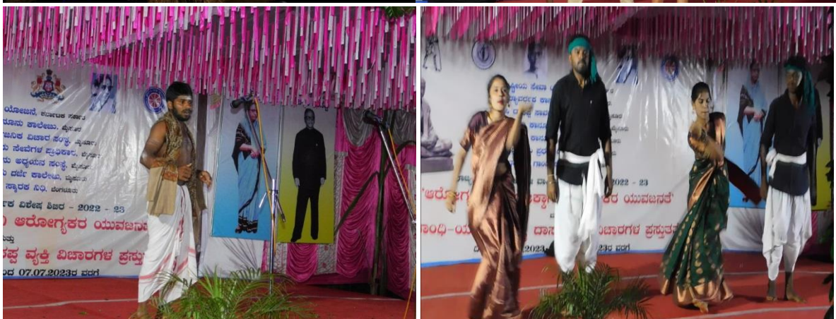
At 8.30p.m- Cultural Activities by NSS Volunteers