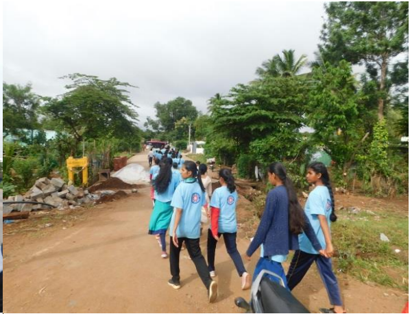
At 3.30 p.m. - A Jatha programme by all NSS Volunteers to invite villagers for inauguration programme.