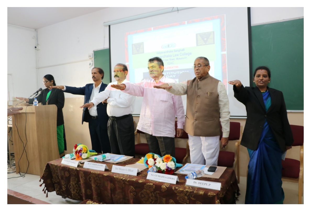
Our students also take part in reciting the preamble of our Indian Constitution.