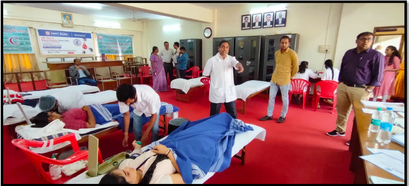
Students of Vidyavardhaka Law College, Mysuru donating blood, the coordinator and volunteer are monitoring the event.